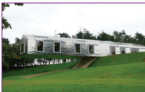
Balancing Barn, Suffolk - United Kingdom Architect : MVRDV Maître d'ouvrage : Living architecture