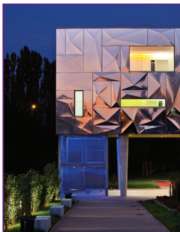
Centre de formation des apprentis hôteliers, Metz - France Architect : Bernard Ropa